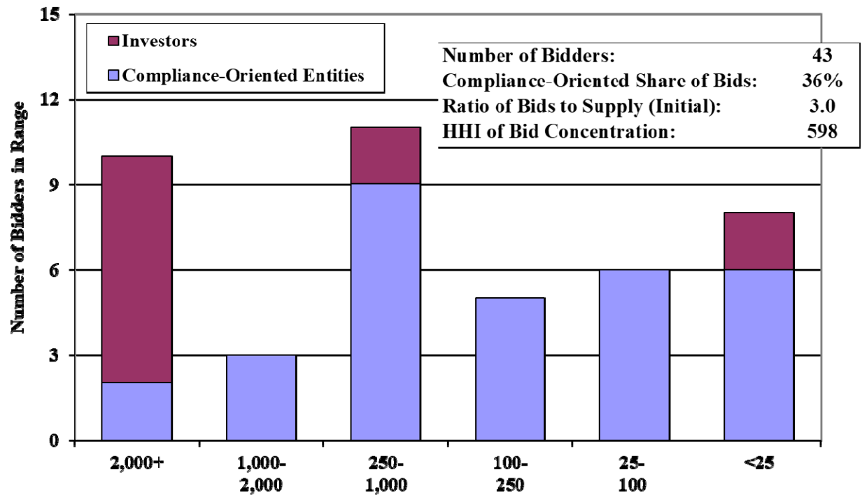
Figure 3: Quantity of Bids Submitted by Entity By Type of Entity and Quantity Bid

The bid quantities were widely distributed among the 43 bidders. The concentration of bids, using the Herfindahl-Hirschman Index ("HHI"), is relatively low at 598, consistent with recent auctions. The HHI is a standard measure of concentration calculated by squaring each entity's share and then summing the squares across all entities (i.e., the index ranges from 0 to 10,000).